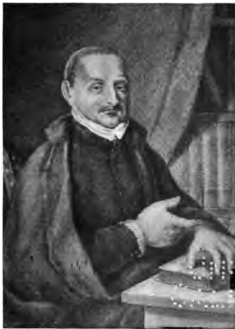
From a print in the Hispanic Society of America Bartolomé Leonardo de Argensola